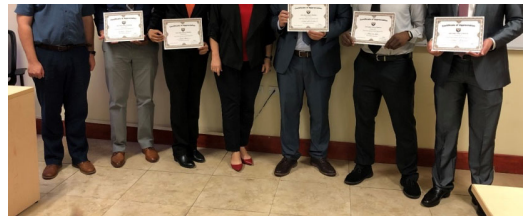
THIRD PLACE: Achievement Award, Team 1