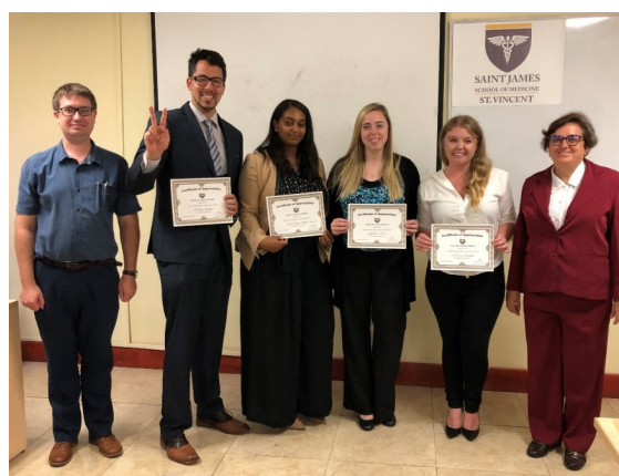
SECOND PLACE: Achievement Award, Team 2