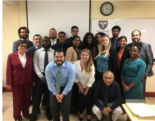
GROUP PICTURE Science Day Presenters & Coordinators