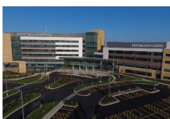
Mercyhealth Javon Bea Hospital and Physician Clinic-Riverside